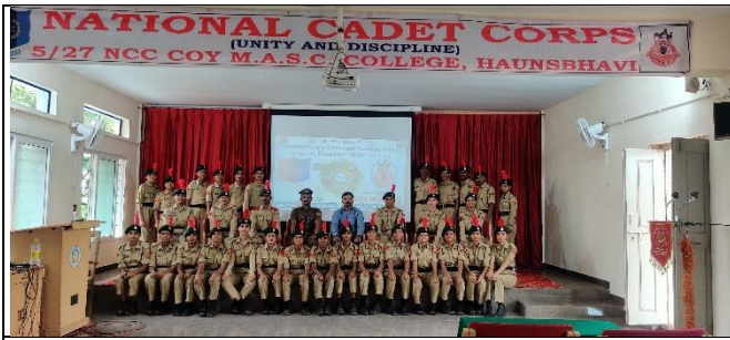
Final Year NCC Cadets Group Photo