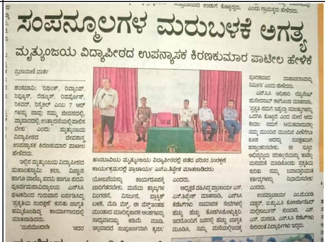
Prajavani Daily News Paper: 28-06-2024