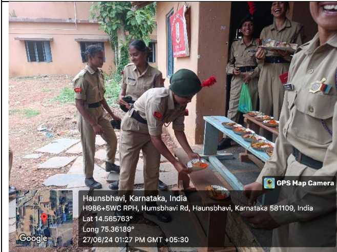
Refreshments for Cadets