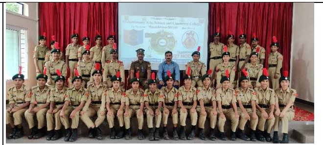
Final Year NCC Cadets Group Photo