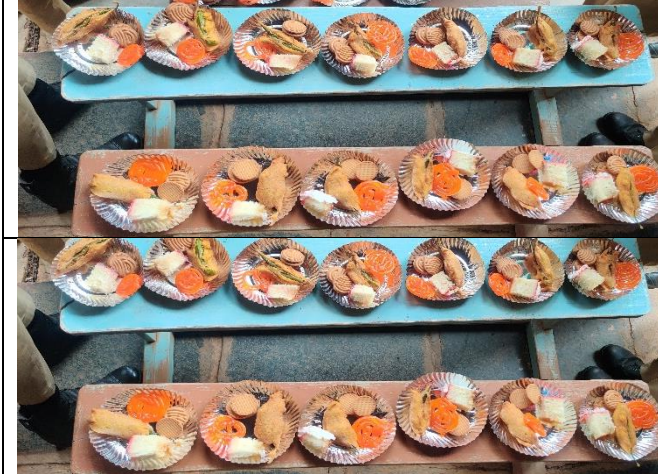
Refreshments for Cadets