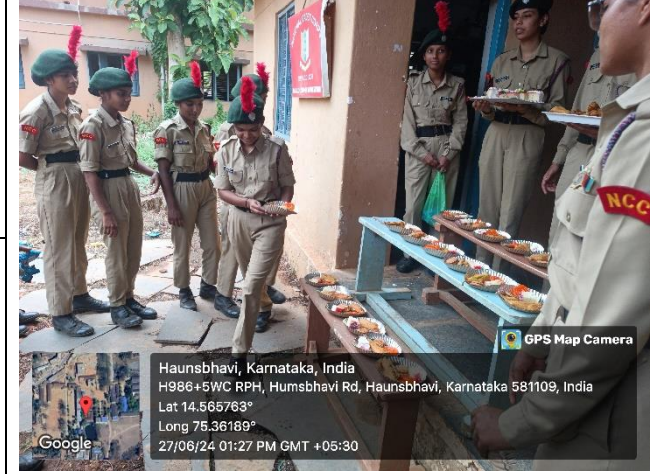
Refreshments for Cadets